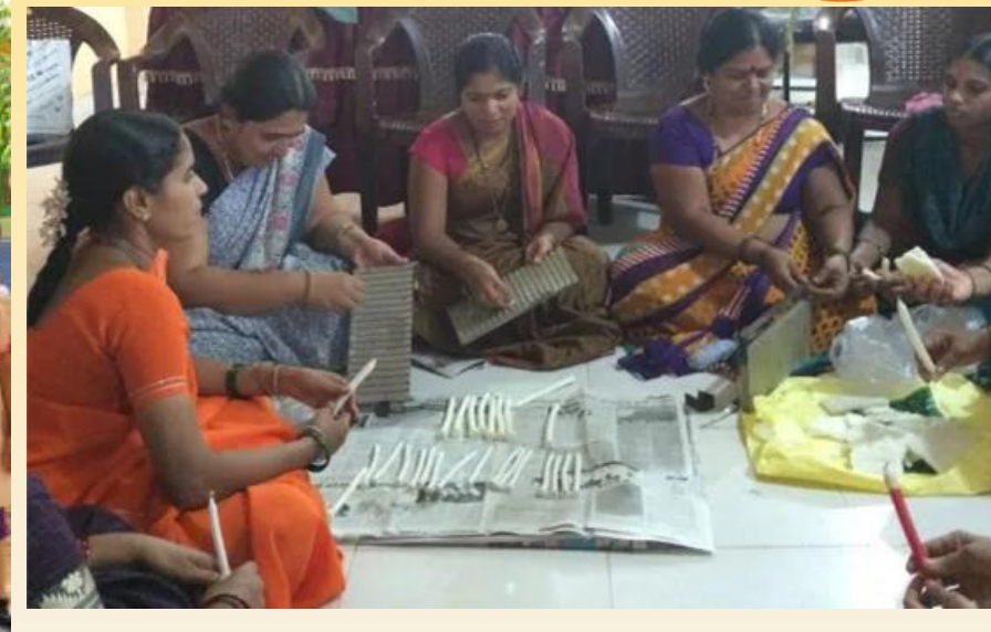
Formation of SHG & organize training on entrepreneur skill for livelihood