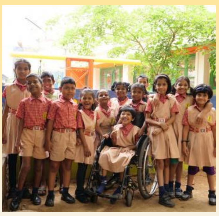
Provide support to the differently abled person