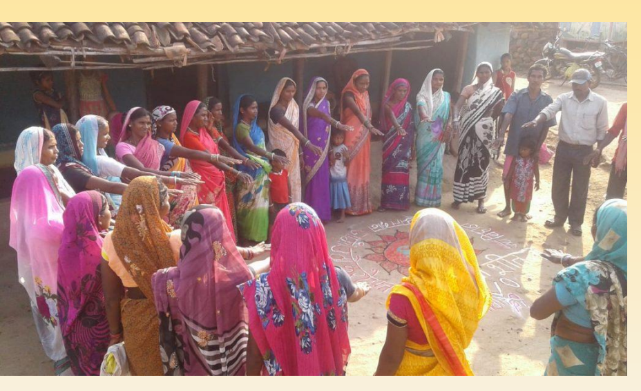
Organize talk show/awareness campaign / rallies on rights of the women & children