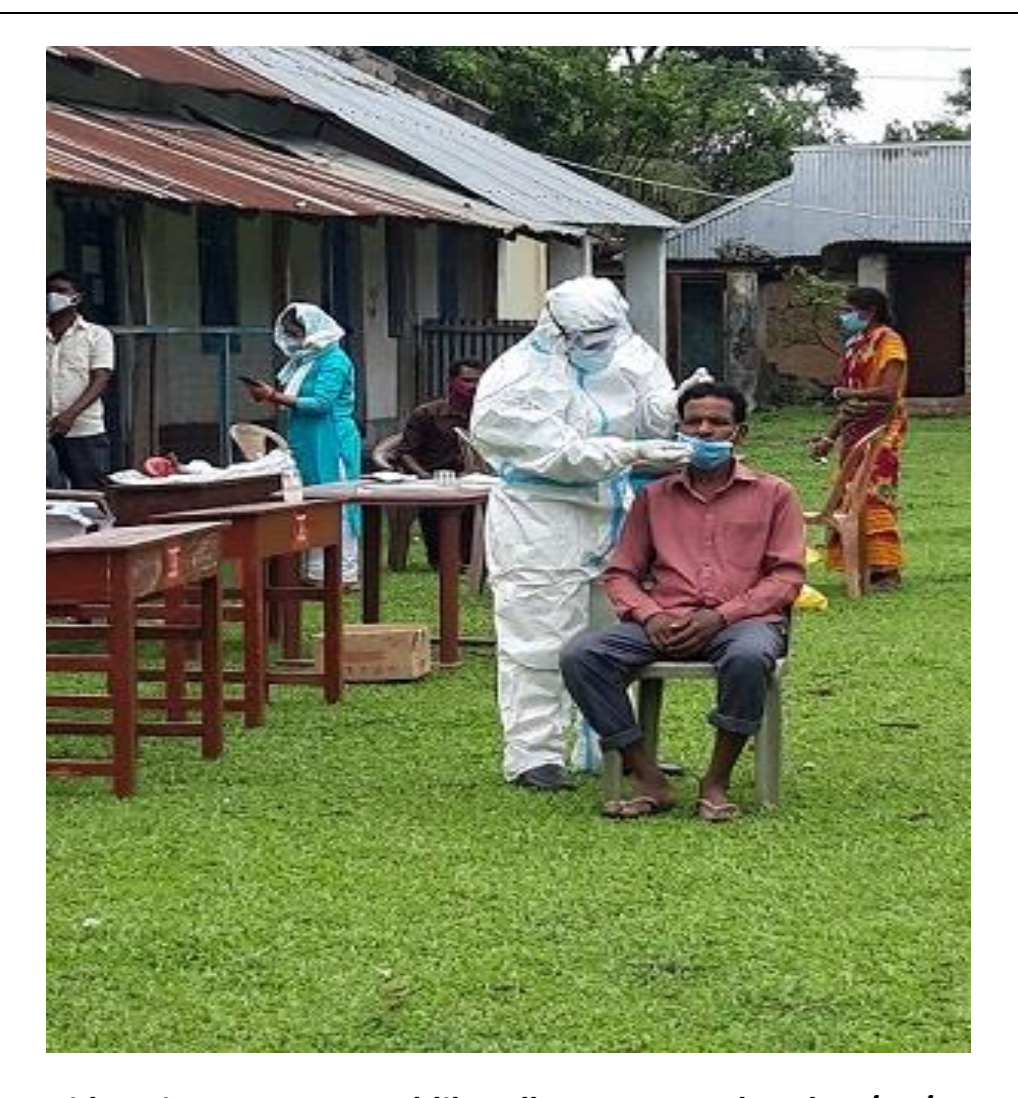
Rapid Antigen test at Meghlibandh Tea Estate dated 05/06/2021