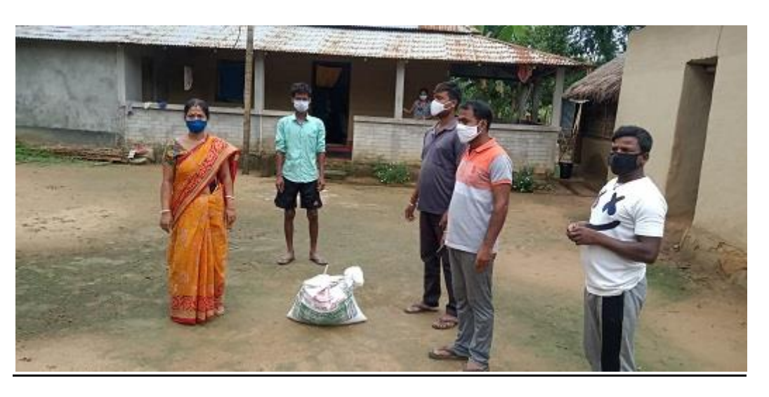
Food items being distributed among various COVID affected families at Meghlibandh Tea Estate