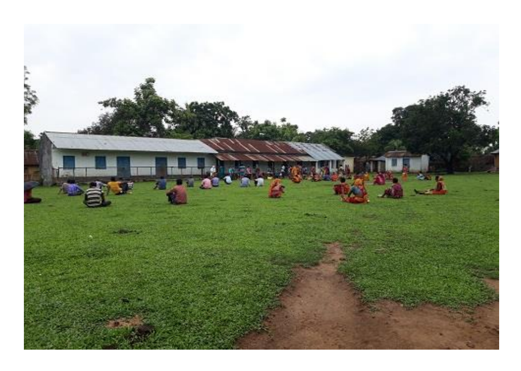
Social Distancing mantained by Tea Estate workers during Rapid antigen test at Meghlibandh Tea Estate