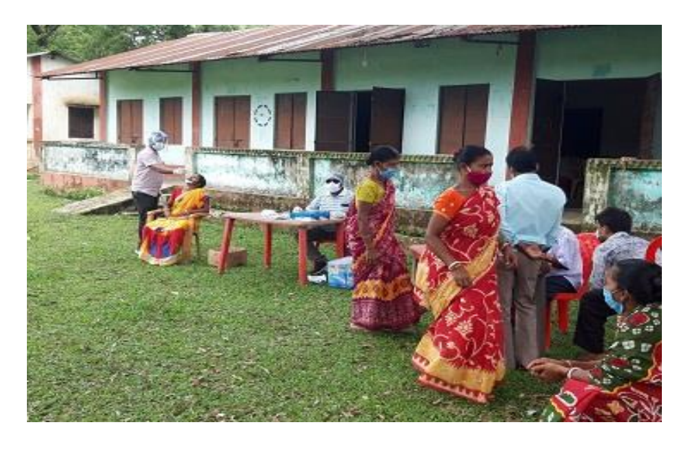
Rapid Antigen test at Bairagipara dated 27/05/2021