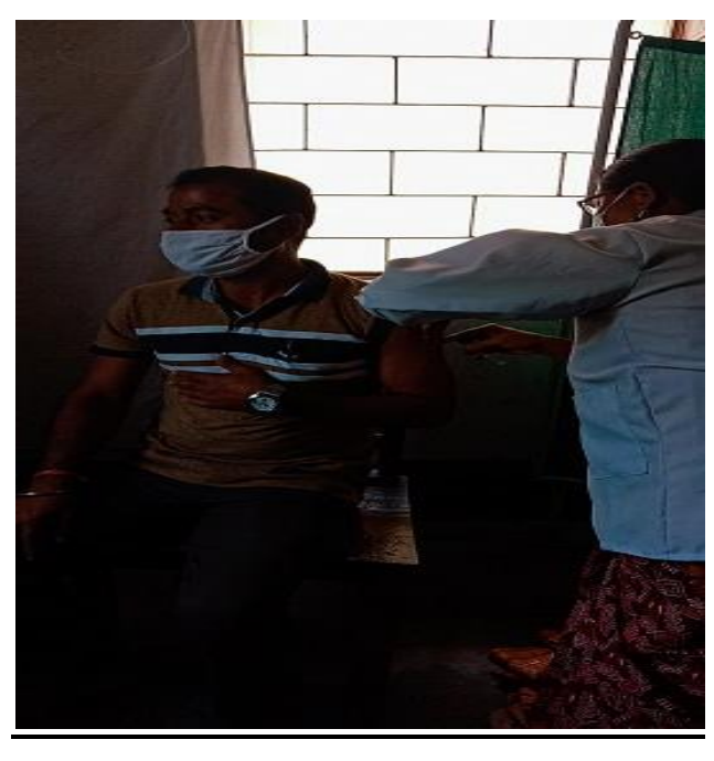
COVID vaccination at Katlamara PHC