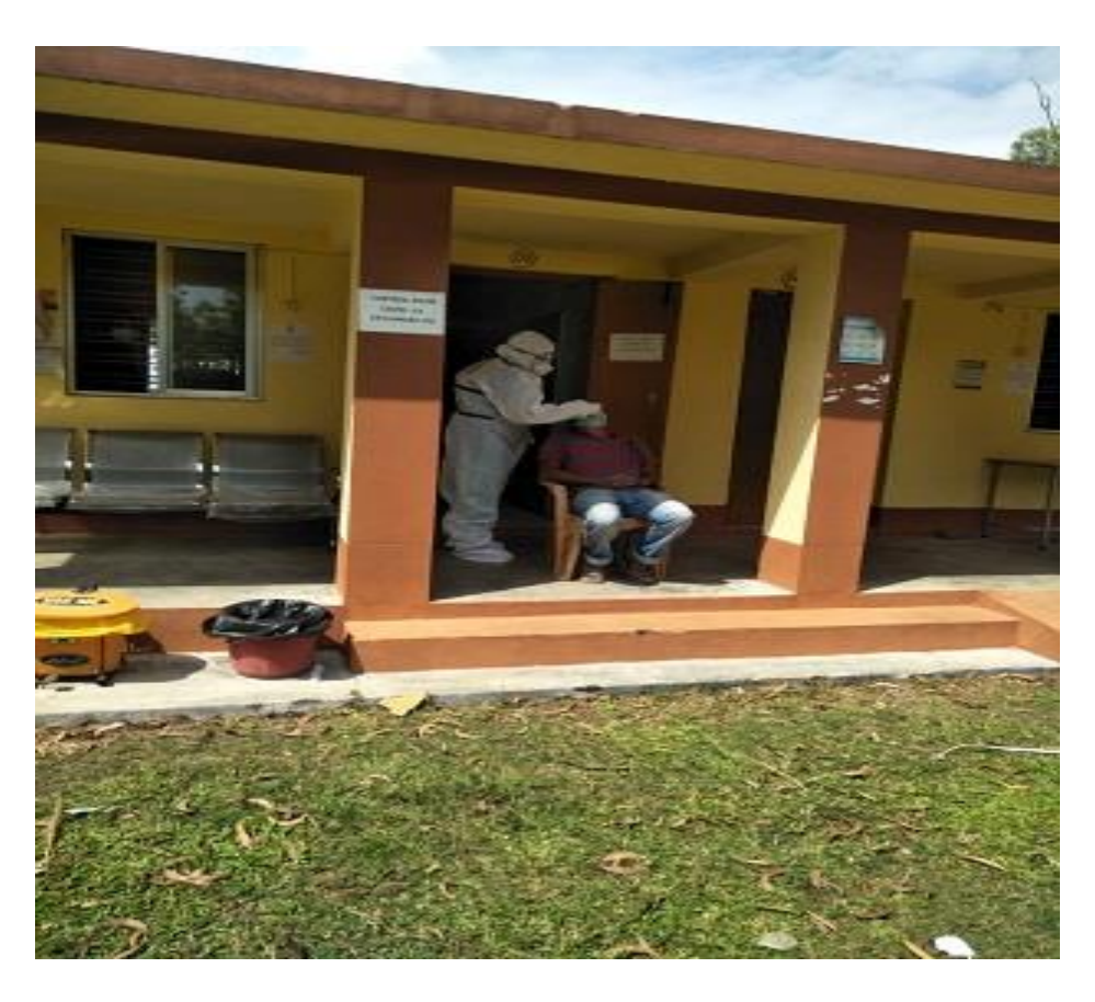
Rapid Antigen test at Katlamara PHC