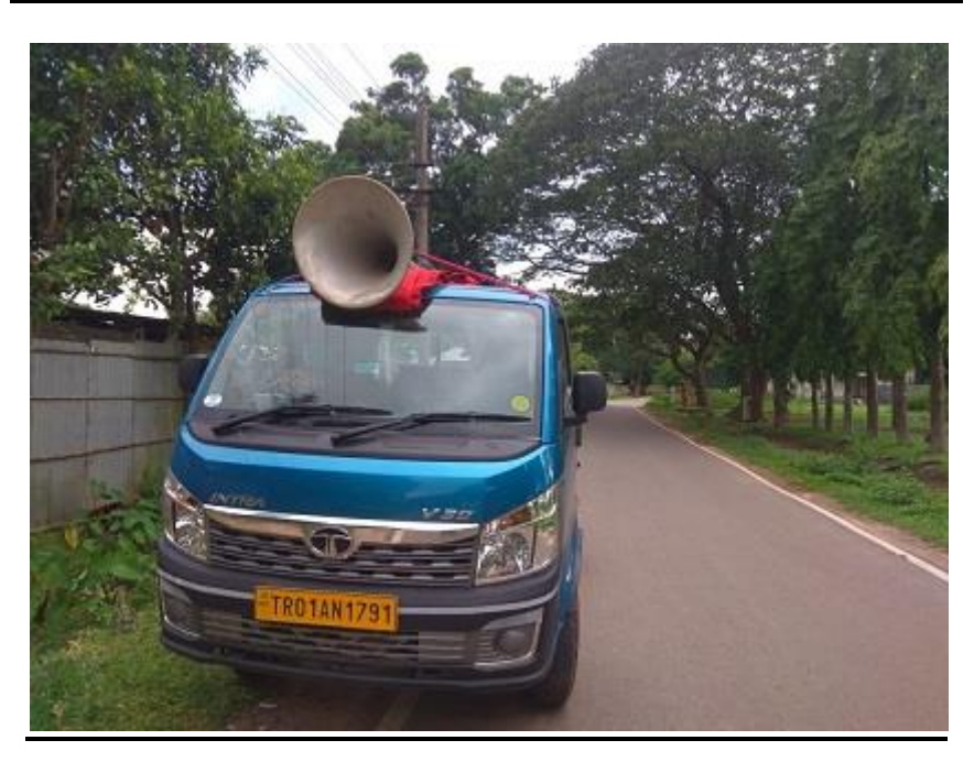
Awareness miking done at GP area