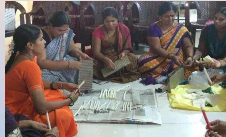
Formation of SHG & organize training on entrepreneur skill for livelihood

Socially Just and Socially secured villages