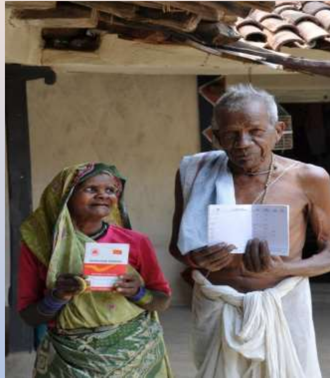
Ensuring Benefits to all disadvantaged people