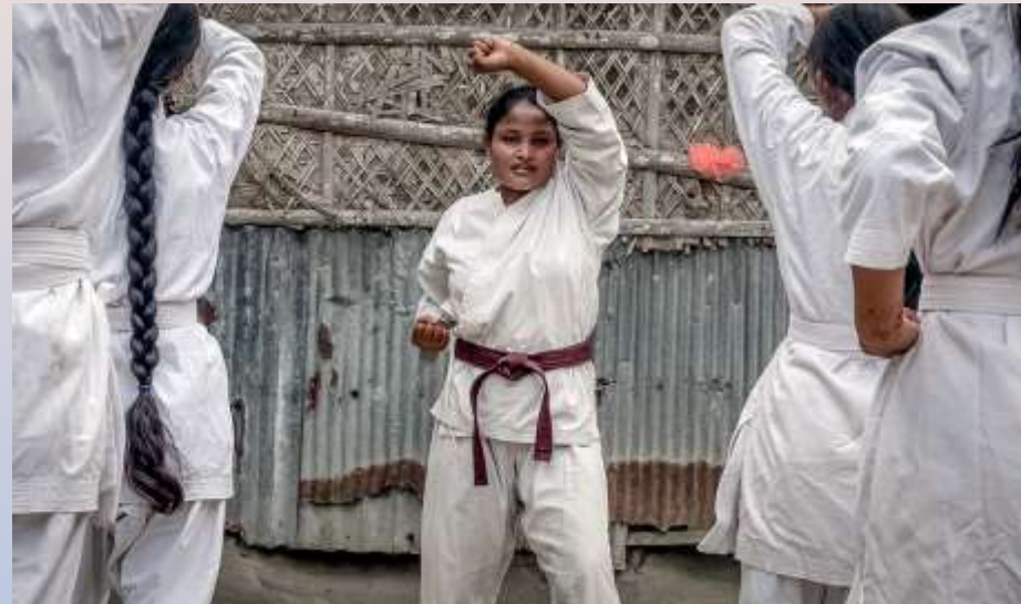
Self protection skills training to the school going girls