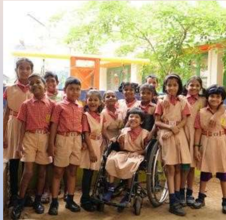
Provide support to the differently abled person