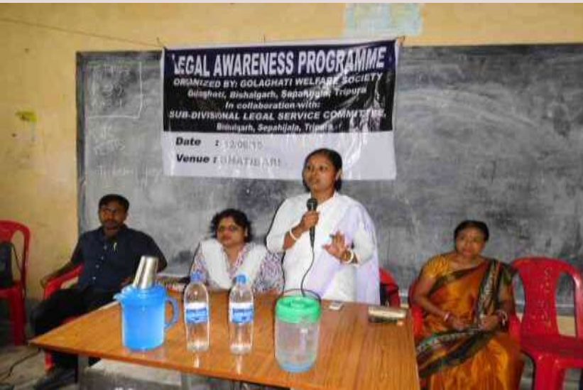
Legal awareness campaign on rights of the women & children