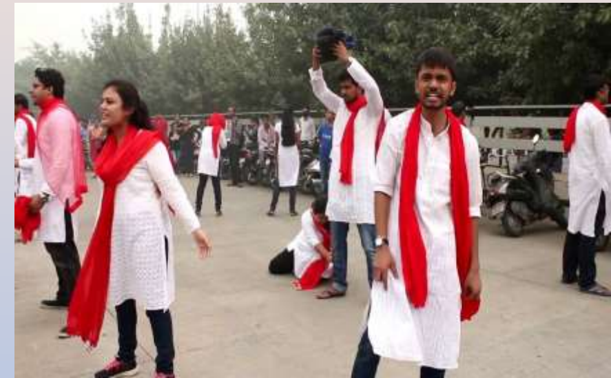
organize street drama

Socially Just and Socially secured villages