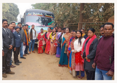
Gram Anweshan jirania RD Block to Amurpur RD Block.