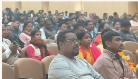
Training on Carbon neutrality at SPRC, Tripura