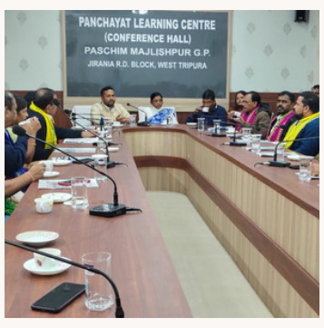
Meeting conducted in the PLC of West Majlishpur

and various platforms, detailing the date, time, venue, and agenda. On day, after meeting verifying the quorum and nominating the president, the meeting begins by fostering active participation through open-ended questions, assigned