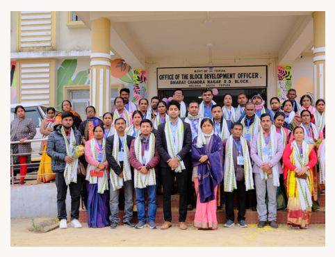
Gram Anweshan of Mohanbhog RD Block to B.C Nagar RD Block