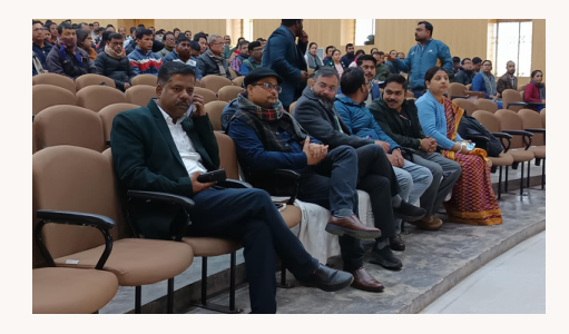
Workshop on Handholding of GPs/VCs organised by the NLU at SPRC