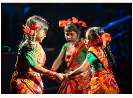
Cultural Fest organised by Amarpur RD Block as a part of Gram Anweshan program