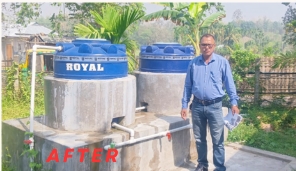
Issues Uploaded in Aamar Sarkar

To further enhance citizen engagement through the Aamar Sarkar Webportal and App, two new approaches implemented: