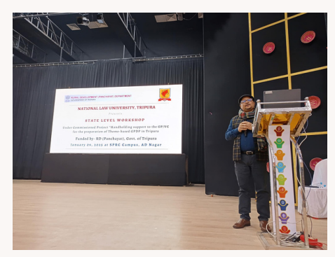
Workshop on Handholding of GPs/VCs organised by the NLU at SPRC