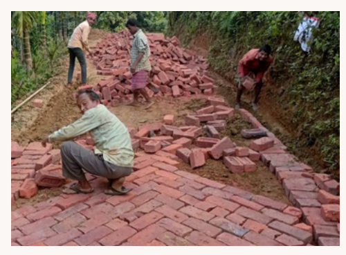
Brick Solling under FFC is being laid at Solonala VC, Pecharthal RD Block